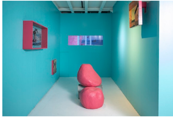
Solo Exhibition "Paradise for Free"